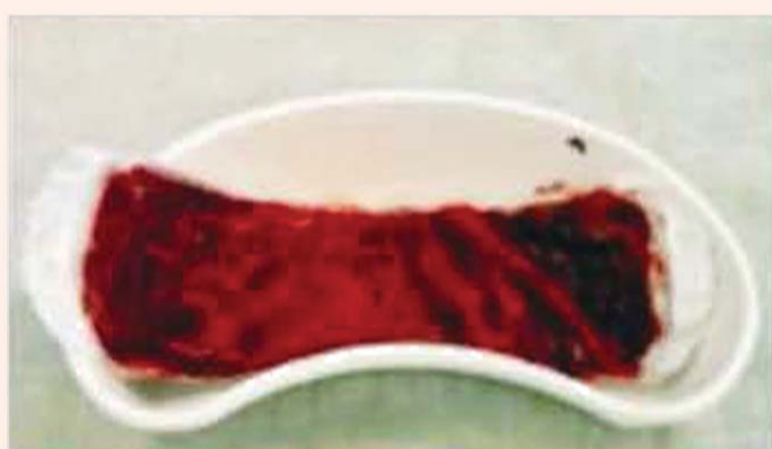
saturated sanitary towel 100 ml