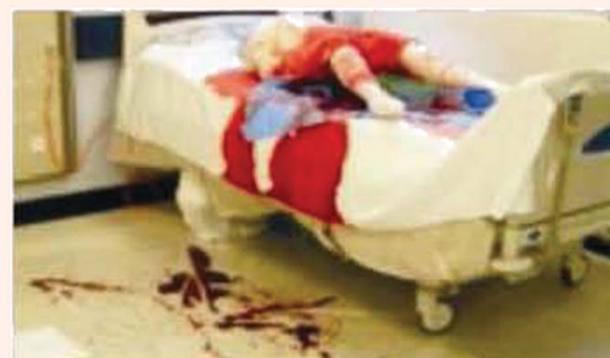
blood spilling to floor 2000 ml