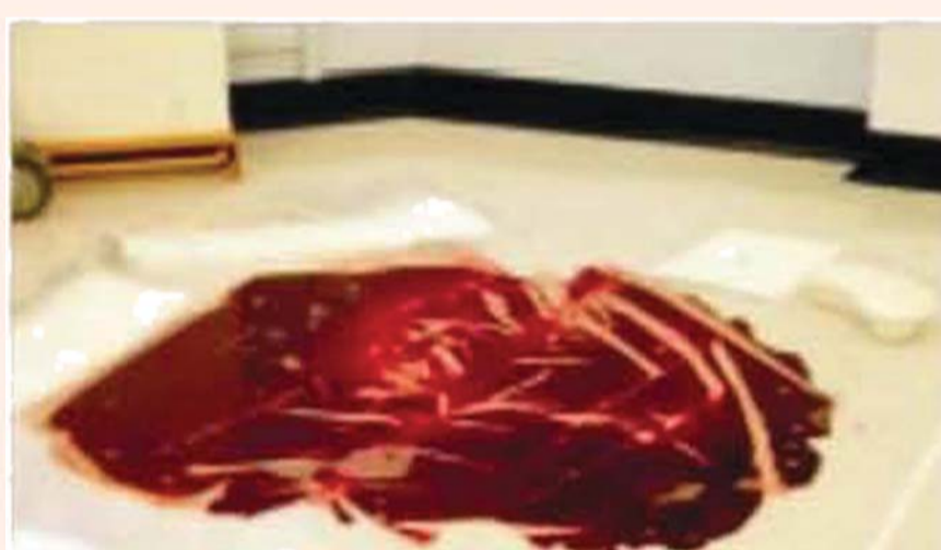
floor spill (100cm diameter) 500 ml