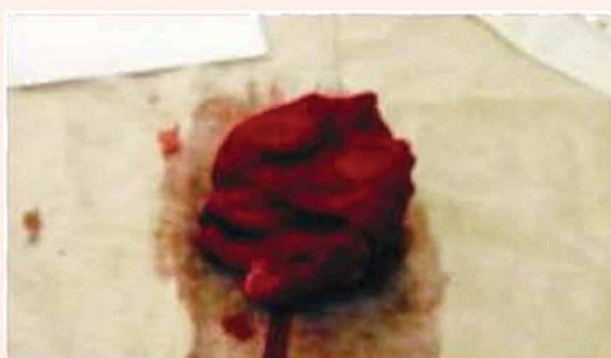
saturated swab (45x45cm) 350 ml