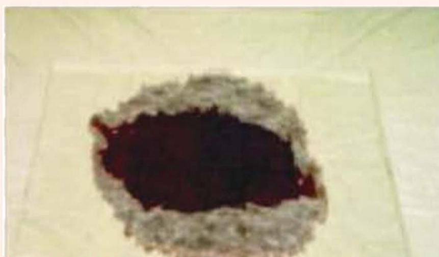
incontinence pad 250 ml