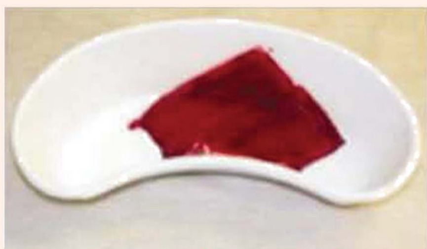
saturated small swab (10x10cm) 60 ml