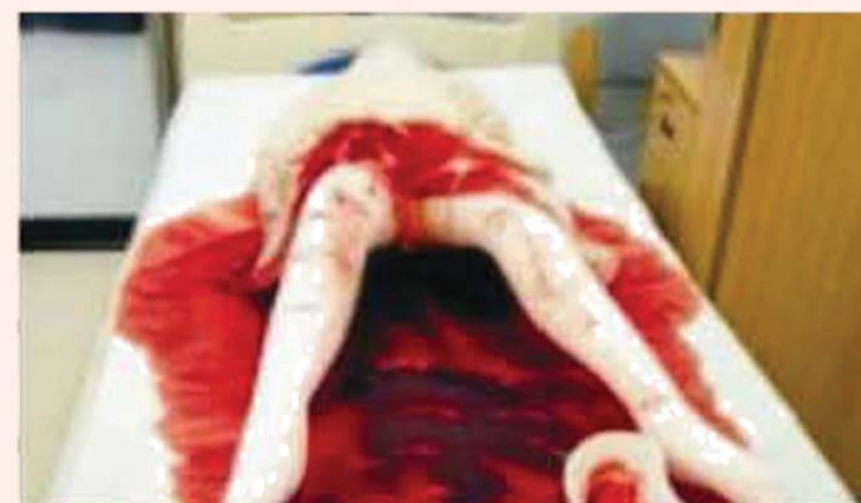
blood spilling on bed 1000 ml