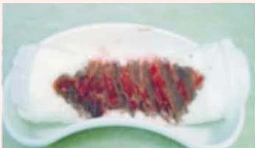
soiled sanitary towel 30ml